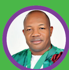
Pr Souleymane KONATÉ Since 09 January 2023